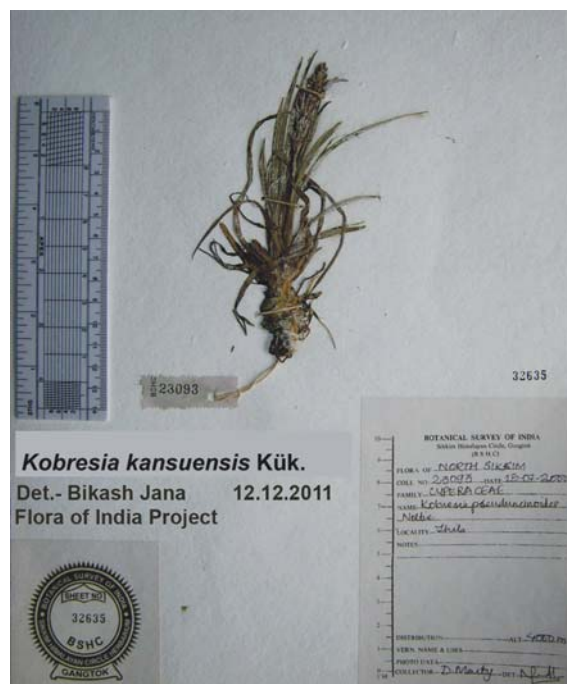
Fig. 2. Scanned image of herbarium specimen (D. Maity 23093, BSHC) of Kobresia kansuensis Kük.

Specimens examined : CHINA, China boreali-occidentalis, Kansu Province, T'ao River basin', Swampy meadow of mountains, west of Adjuan, 3500 m, October, 1925, J.F. Rock 13714 (Isotype, A!). INDIA, Sikkim, North Sikkim district, Thila, 4000 m, 13.7.2000, D. Maity 23093 (BSHC).