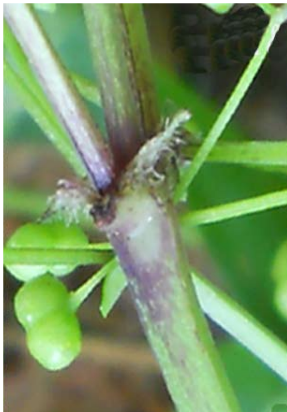
Fig. 1. Hedyotis kurzii Merr.: Root stock and Stem showing stipule and fruit.

cm, in remote pairs, undulate, acute at apex, cuneate or sometimes oblique at base, glabrous; petiole up to 1.2 cm long, glabrous. Stipules connate, up to 2 mm long, 4–6-dentate. Inflorescence terminal and axillary, slender, trichotomous, lax, paniculate cymes;