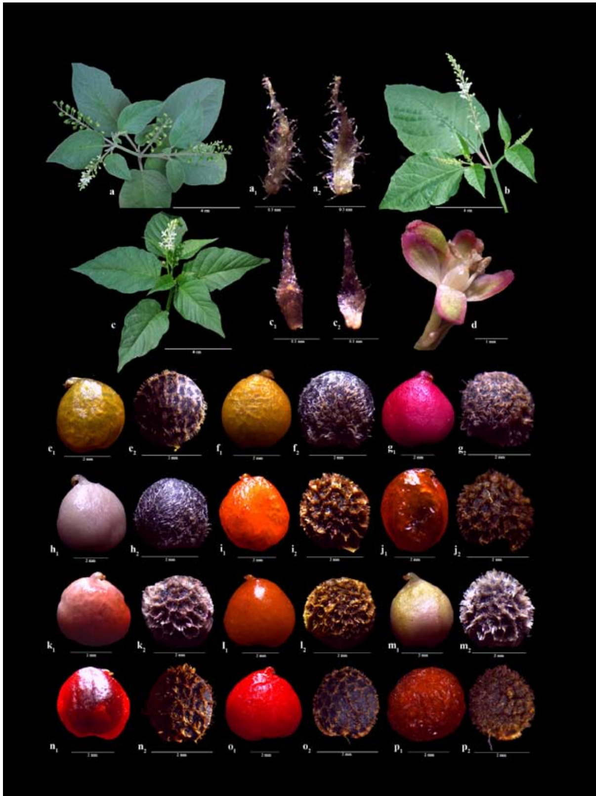
Fig.1. Rivina humilis var. humilis L.: a. Flowering twig; a 1 & a 2 , Bracts, dorsal and ventral face; ( a , a 1 & a 2 - from densely pubescent plant with subulate bracts; b. Flowering twig (almost glabrous plant with very large growth habit); c. Flowering twig; c 1 & c 2 , Bracts, dorsal and ventral face; d. Flower; e 1 - p 2 , Fruits with respective seeds.