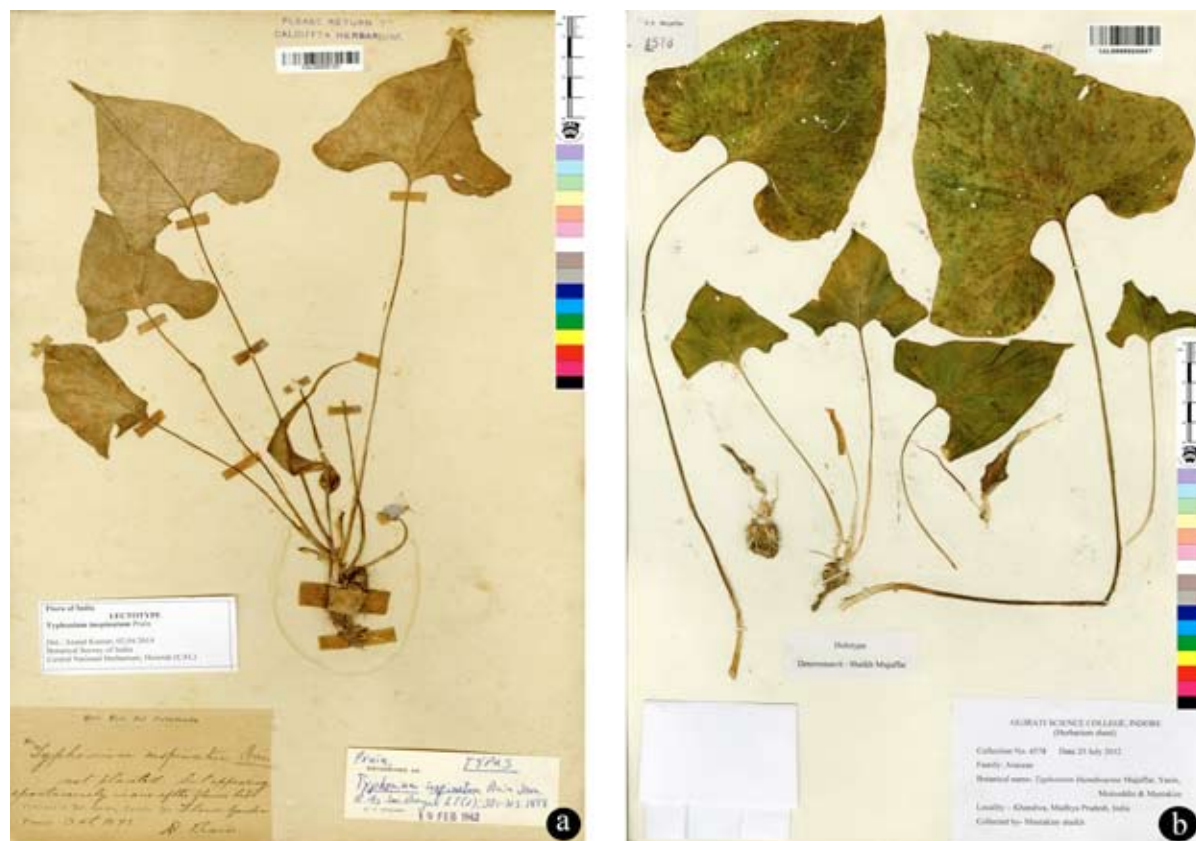
Fig. 2. a. Lectotype of Typhonium inopinatum Prain; b. Holotype of T. khandwaense Mujaffar Yasin & Mustakim

4.3–9 cm long, shorter than spathe limb with a basal pistillate zone followed by a zone of sterile flowers, a naked zone or interstice, a staminate zone and a terminal barren appendix. Both pistillate and sterile flower zones are enclosed by basal tube. Pistillate zone conical, 3–3.5 mm long, greenish; flowers sessile, 1–1.5 mm long; ovary ellipsoid, 1–1.3 mm long, glabrous; style very short; stigma disc-shaped, c. 0.3 mm diam., glabrous. Sterile flower zone yellow, 2–4.5 mm long; sterile flowers filiform, decurved with entire or bifurcated pointed tip, each 2.5–4 mm long, yellow, partially covering pistillate flower zone. Naked zone 6–9 mm long. Staminate zone cylindrical, 5–9 × 2–3 mm, pale yellow; flowers sessile, 0.5–1 mm long with 2 thecae; dehiscence by apical short slits or pores.