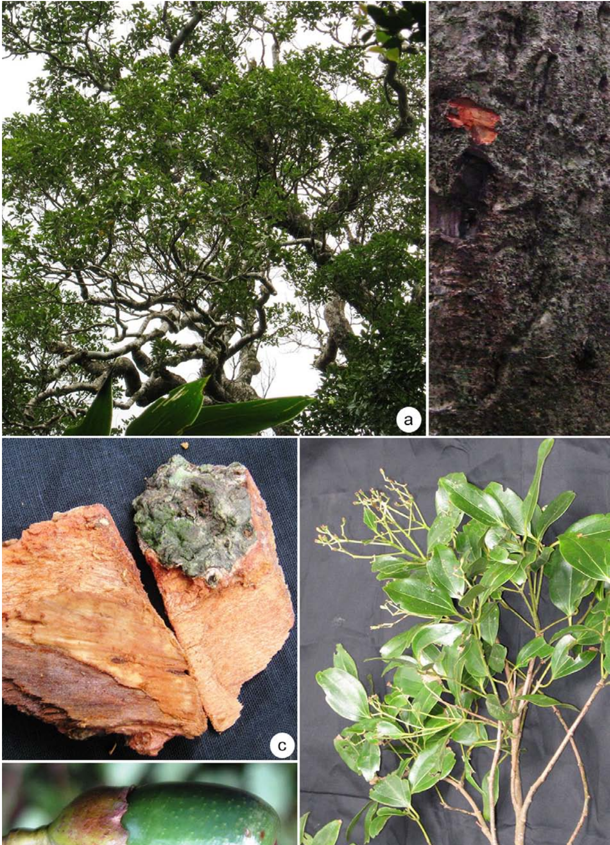
Fig. 2. Cinnamomum litseaefolium Thwaites: a. Habit; b. A view of bark on the trunk; c. Closer view of bark; d. A flowering twig; e. A fruit.